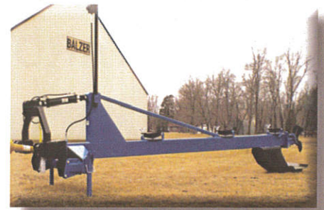
Three point mounted models are available in 21' and 25' lengths.

The 48' and 58' prop agitators feature the improved frame and bracing to support the additional length and provide extra durability and strength. The Balzer Prop Agitator prop is balanced steel helical style design for high performance and efficiency. Three prop sizes - 19", 23-1/2" and 28" to match the agitator to your needs and horsepower requirements.