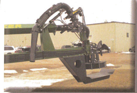
Magnum Express Lagoon Pump w/ V-6 Pump

The standard hydraulic valve bank controlling the agitation nozzle horizontal and vertical movement, and agitate and load flapper valve is standard. The valve can be operated on lagoon bank or in tractor cab.