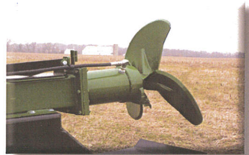
Commercial Lower end seal assembly for 4" Drive lines only