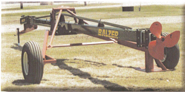
Trailer Mount Prop Agitator

The 48' and 58' prop agitators feature the improved frame and bracing to support the additional length and provide extra durability and strength. The Balzer Prop Agitator prop is balanced steel helical style design for high performance and efficiency. Three prop sizes - 19", 23-1/2" and 28" to match the agitator to your needs and horsepower requirements.